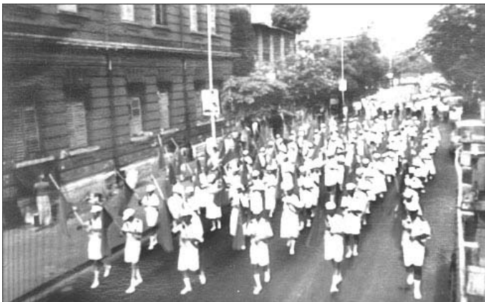
Volunteers of Komsomol march in honour