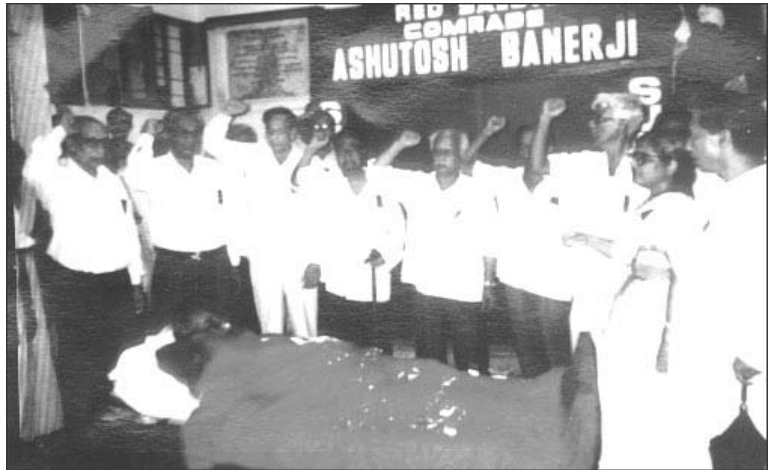
Central leaders and comrades stand in red salute before mortal remains consigned to flames

Pedestrians, shopkeepers, hawkers, porters, students, housemaids, and passengers waiting to catch a bus or pacing towards the railway station have thronged the Moulali crossroads to catch a glimpse of the flow of the journey. "I could say from the look of it, this is the SUCI sure," a man mutters, perhaps to himself. What is it which makes so