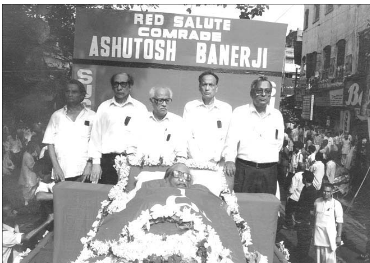
Central Committee members and Central Staff stand behind the bier