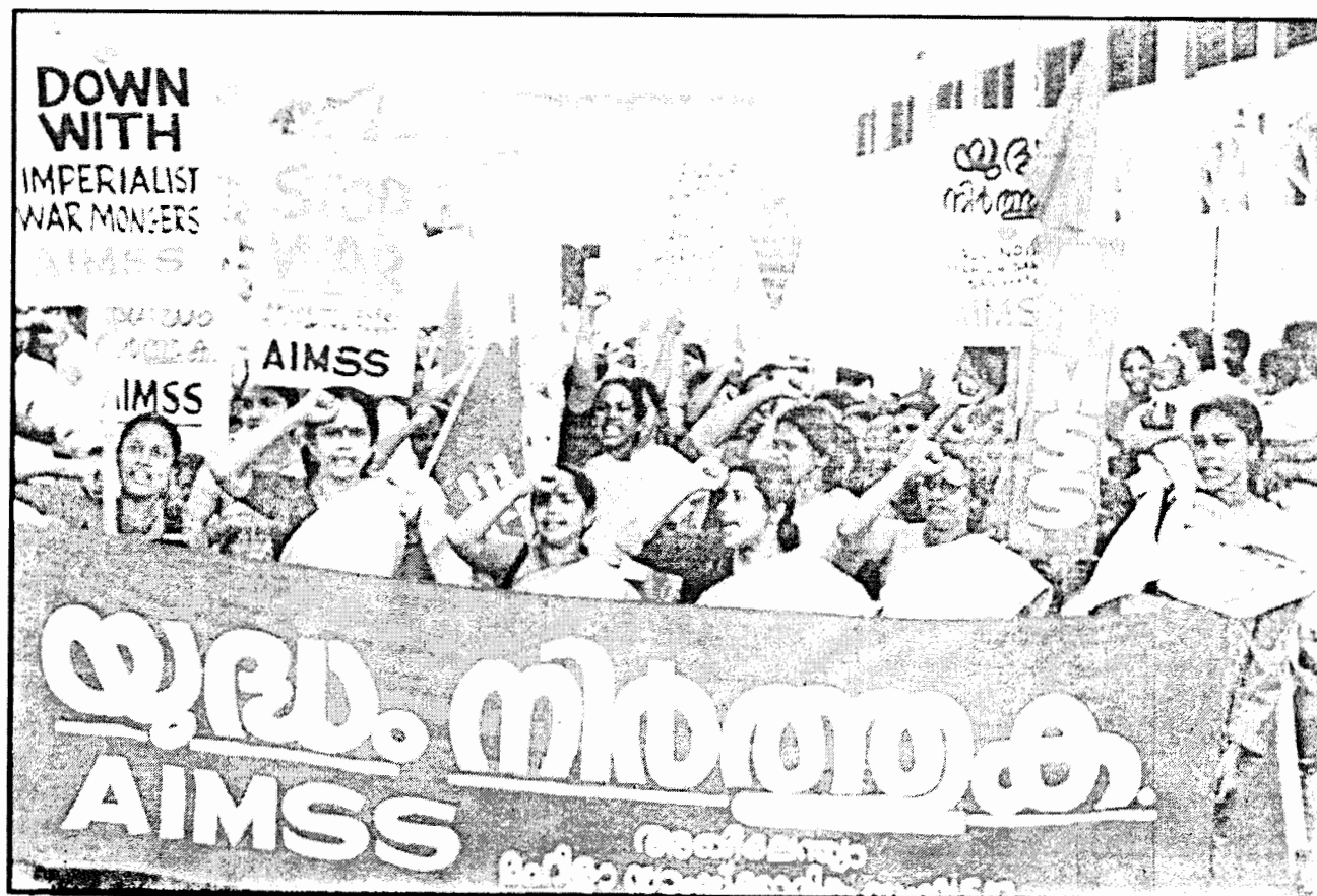
Protest March by AIMSS activists in Cochin