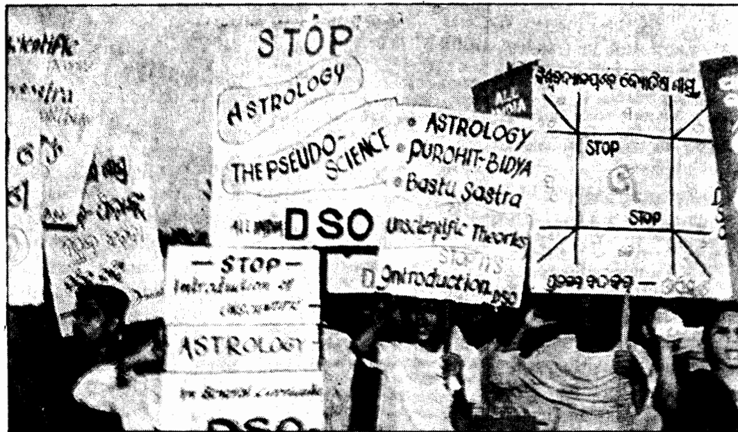
AIDSO's Protest Rally on 20th June in front of Raj Bhawan in Bhubaneswar against the BJP govt's decision to include Purohit Vidya, Astrology and Vastu-shastra in educational curriculum

We demand immediate halt to this arms training and appeal to all secular and democratic-minded people to organise themselves to mount pressure upon the government.