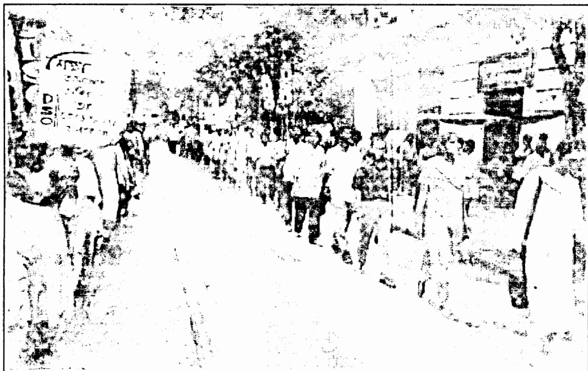
Students' protest march in Calcutta against Left Front government's policy of Fee Hike on 22 June, 2001

In our last issue dt. 15.6.01 the headline of the news item 'Nation Labour Conference' should have read 'Indian Labour Conference' and the preface should have read: 'Comrade Ashutosh Banerji, President, UTUC-LS while representing UTUC-LS at the thirtyseventh session of the Indian Labour Conference in Delhi, sharply denounced the government's globalisation policy in presence of the Labour Minister and Prime Minister respectively on 11th and 12th May, '01 and in the conference on 18th and 19 May '01. We regret the mistakes.