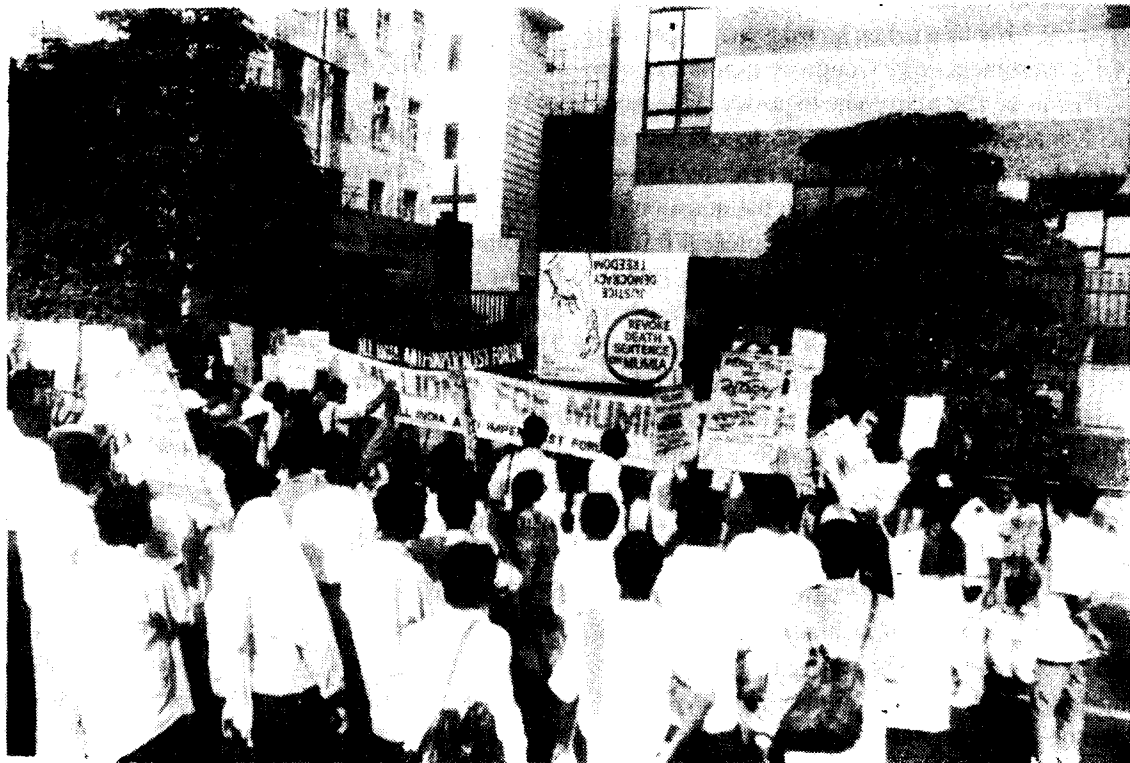
Protest demonstration by All India Anti-Imperialist Forum on 24-4-98 in front of USIS, Calcutta on demand of scrapping death sentence against Mumia Abu-Jamal

A memorandum to this effect addressed to President Bill Clinton was handed over to the representative of the United States Information Centre.