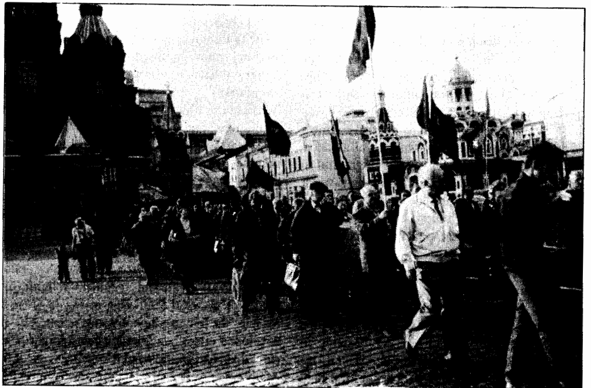
Procession towards Lenin Mausoleum in Red Square, Moscow on Lenin's birthday (more photo on page 8)

"This senseless bankrupt bourgeois parliamentarism reflective of acute economic crisis can only be rebuffed by the people taking to the path of countrywide democratic mass and class struggles and giving birth to peoples political power. Our party urges the people to grasp this all important lesson and prepare themselves accordingly."