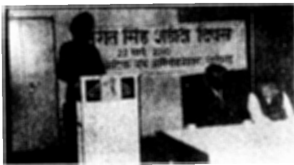
Saheed-e-Azam Bhagat Singh Day being observed at Chandigarh on 23rd March, 2000 under the auspices of DYD