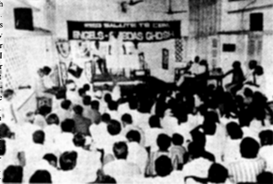
Gathering at the Assembly Hall of the Study Centre of Marxism-Leninism-Comrade Shibdas Ghosh Thought on 5th August

The memorial day of Comrade Shibdas Ghosh was observed by prisoners of the Alipore Central jail with deep pain and grim revolutionary determination on 5th August. They were trying to build up movement of the exploited people guided by the teachings of Comrade Ghosh and because of this 'crime' they were either convicted or undertrials in the Court of the ruling class. Two hundred such prisoners were present in the memorial meeting to pay homage to the beloved