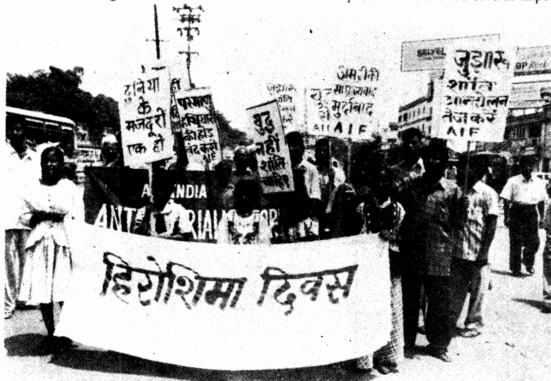
Procession in Patna on Hiroshima Day