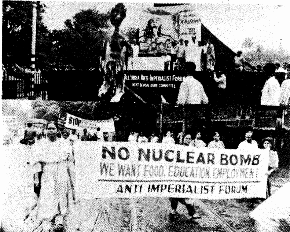
(Above) Effigy of Bill Clinton burning in Calcutta (below) Procession

Finally, a meeting was held near the Patna railway junction. Several speakers spoke at length on the occasion. They pointed out that the