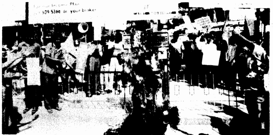
Symbol of communalism being burnt in Bangalore