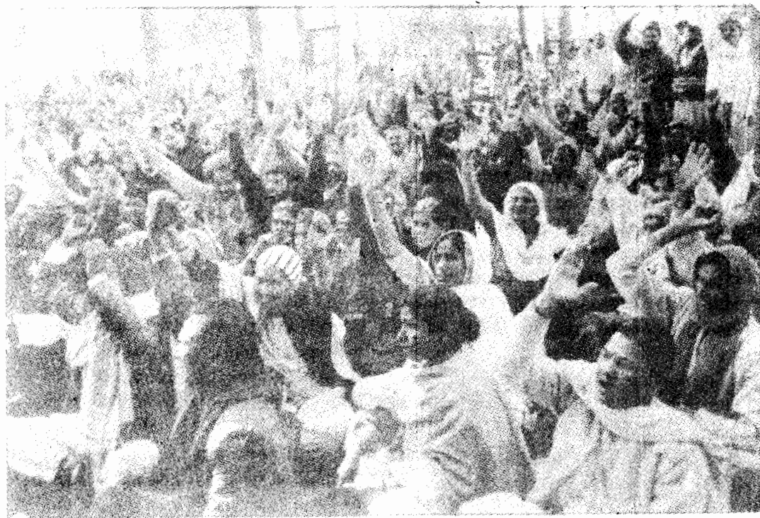
National Platform of Mass Organisations held sit-in-demonstration in Chandigarh on 3.2.99