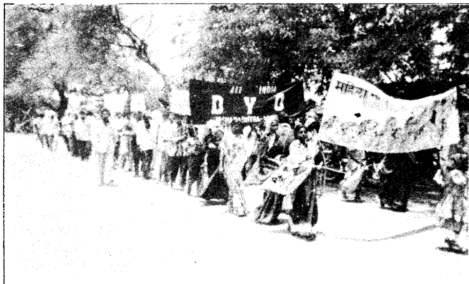
Procession against sale of liquor in villages led by AIMSS and DYO on 2nd May at Nagpur