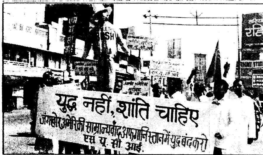
Anti-war demonstrations at (above) Rohtak and (below) Rewari, Haryana

A memorandum addressed to the President of India sharply protesting the heinous attack of America on Afghanistan killing children, old, infirm and destroying hospitals, villages and towns, and condemning the servile role of BJP-led government in the war to appease the US was handed over to the D.M.