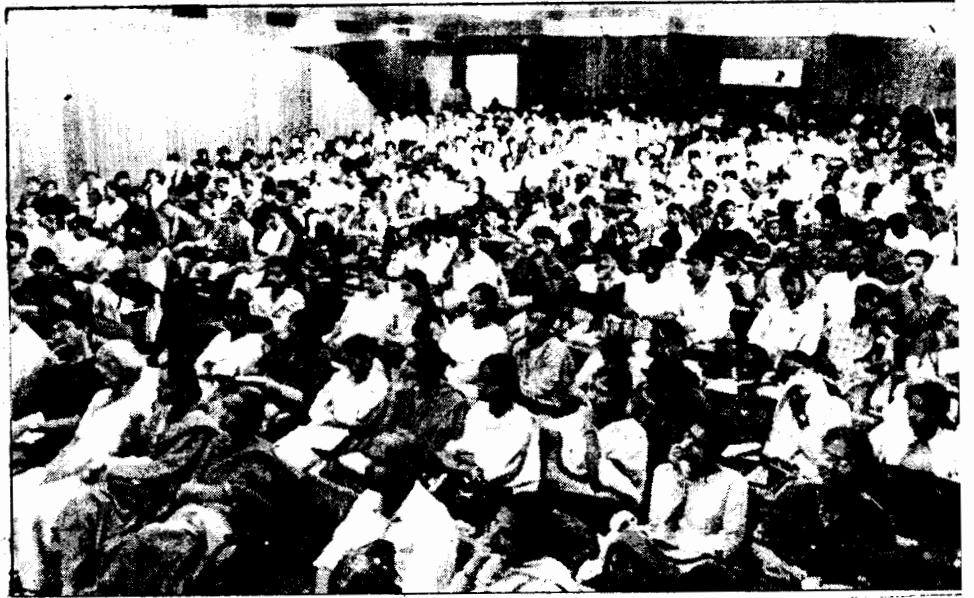
A section of gathering at the Save Education Convention in Bangalore