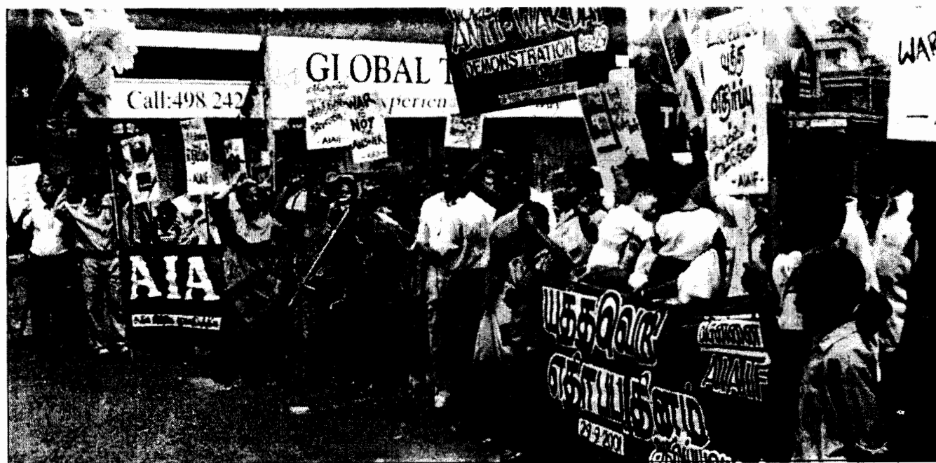
Anti war protest in Chennai by AIAIF on 29.9.2001

On 13th October a joint meeting was held at Khudiram Basu Maidan at Mazuffarpur participated by SUCI, CPI, CPI(M), FB, RSP, SP.