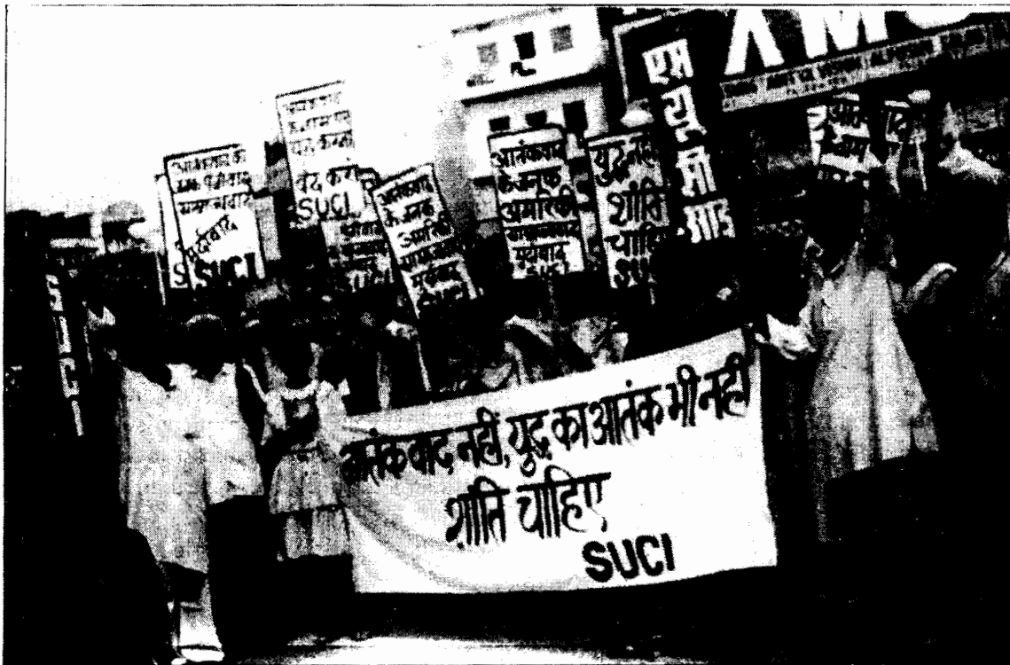
Anti-war protest in Patna on 10-10-2001 by SUCI activists