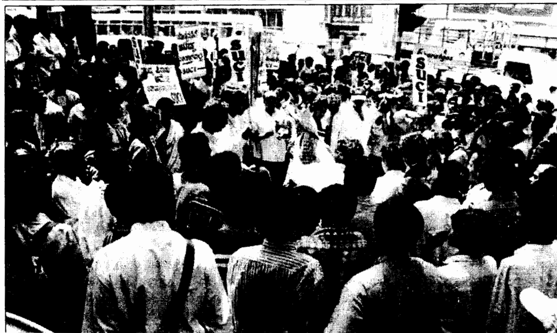
Anti-war protest in Bangalore. Another anti-war demonstration was held in Bangalore on 29.9.2001.