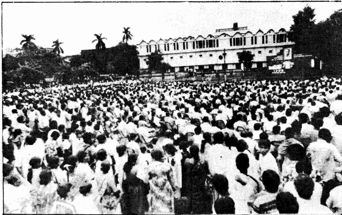
A section of the gathering at Subodh Mullick Square, Calcutta at the memorial meeting