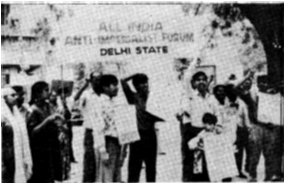
Activists of All India Anti-Imperialist Forum protesting against the recent US nuclear test in New Delhi

A memorandum addressed to the American President condemning the test was later sent by post to the American Ambassador with a request to forward it to the President (since 6th July was a holiday for the American Centre).