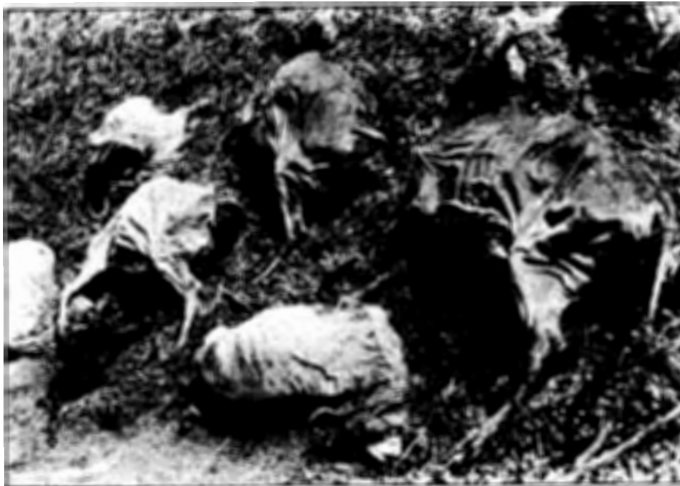
Carcasses strewn in a village — a common sight