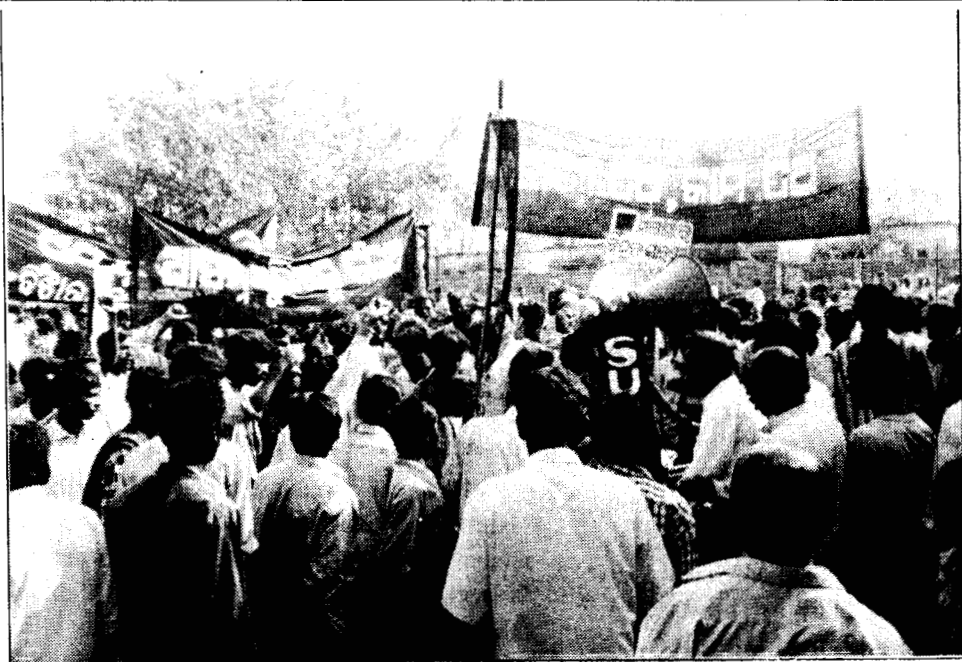
A protest demonstration organised by SUCI with the demand for rehabilitation and adequate relief to the affected people of Orissa