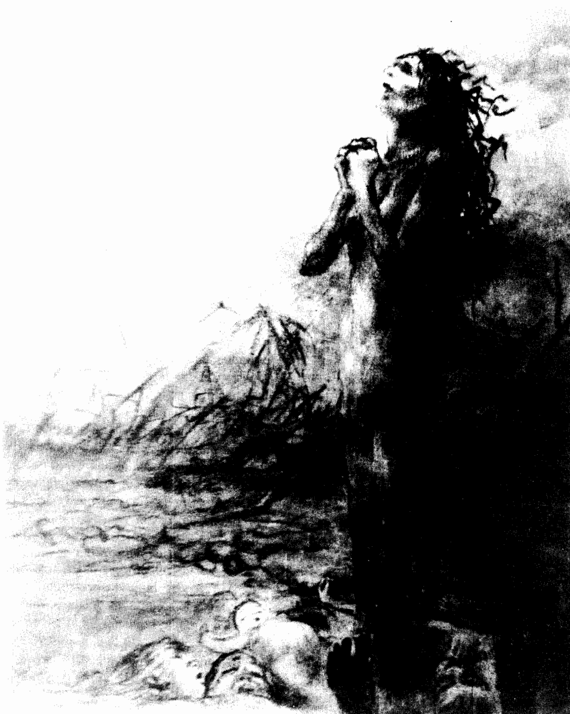
MOTHER ORISSA CRYING

We have the firm faith that acting with the best of human values, people from all walks of life will make this occasion a grand success, compelling the patently anti-people, unconcerned Central BJP government to take heed and act to save Orissa.