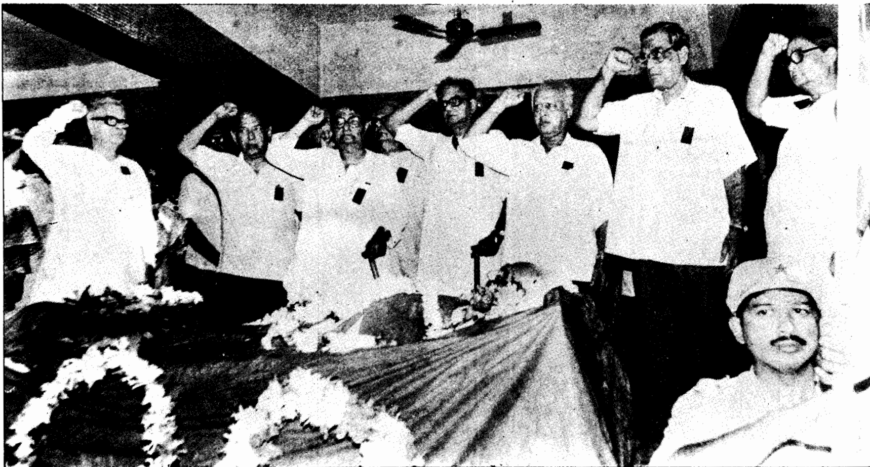
Central Committee and Central Staff members paying RED SALUTE at Keoratala Crematorium