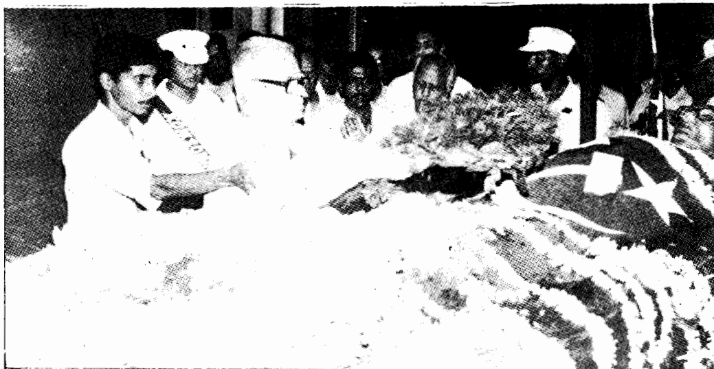
Comrade General Secretary paying homage

The journey started at 4 p.m. Beside the bier where lay the mortal remains, the respected members of the Central Committee and some Central Staff and some volunteers were seated followed by cars carrying the old and physically