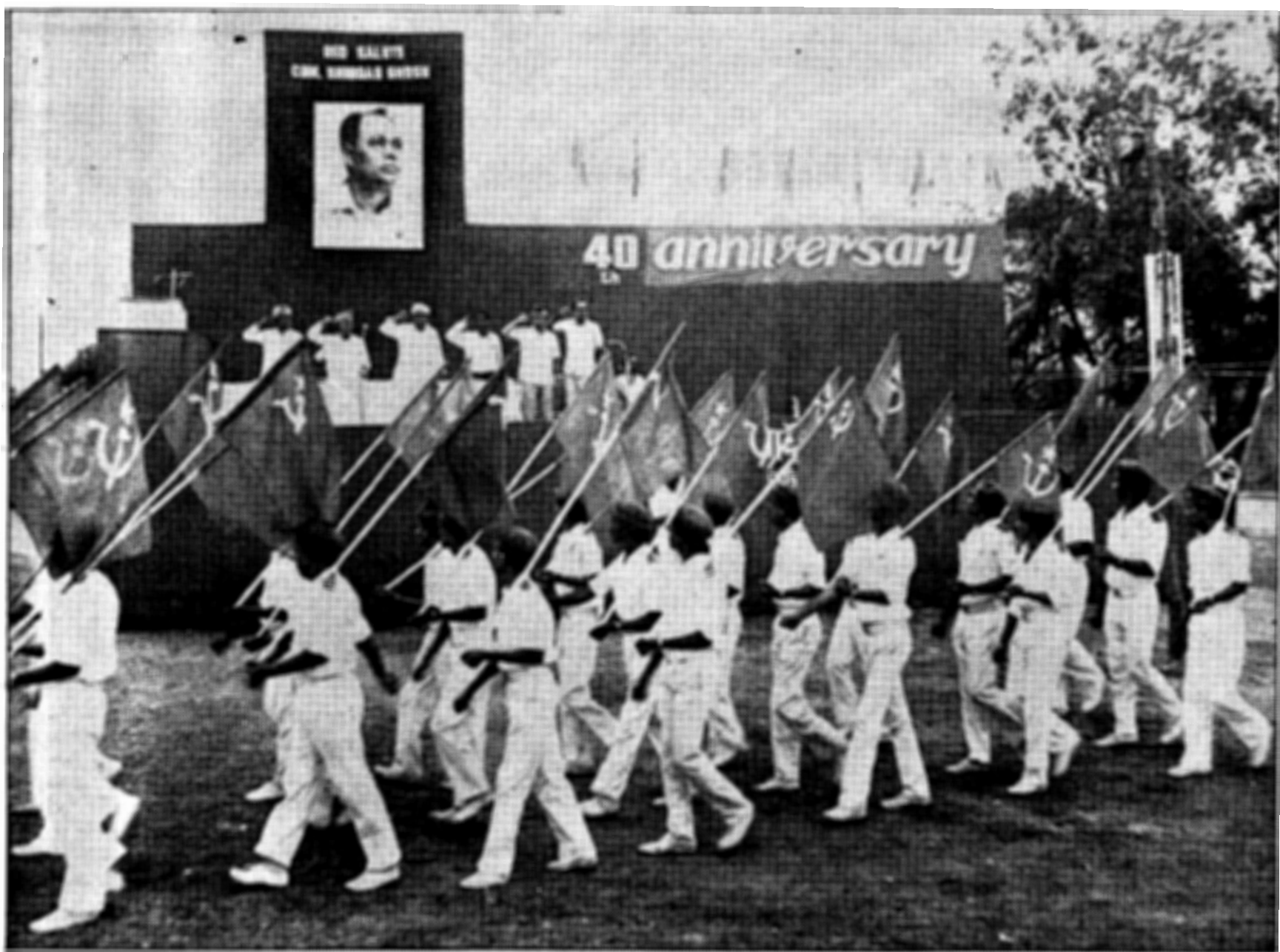
Volunteers from Komsomol and mass fronts presenting guard of honour on 24th April in Calcutta.