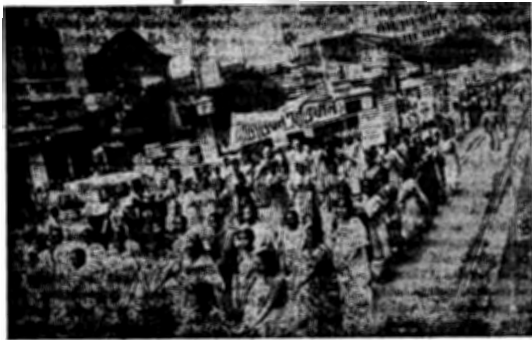
Massive Women's rally in Calcutta

March to Rajbhavan, under the banner of the Mahila Sanskritik Sangha (MSS), drew thousands of women from all walks of life on 10th September in Calcutta. It marked a protest demonstration by women of all ages, from all districts of West Bengal, against the fascist onslaught on democracy mounted by the Central Congress(I) government and the anti-people policies of the 'Left Front' government of the state.