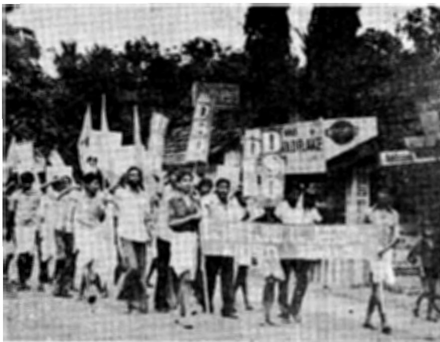
AIDSO organises rally against the Central Education bill in Kerala