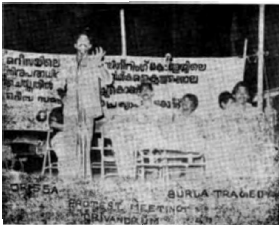
Leaders of AIDSO, AISF, PSU, and ABVP addressing the joint rally in support of Orissa Students' movement at Trivandrum, Kerala

The movement waged by the AIDSO all over the country against the Central Bill on education has now spread into the districts of Kerala. On 29th August last, demonstrations were held in the headquarters of several districts in the state under the aegis of the Kerala (Contd. on page 4)