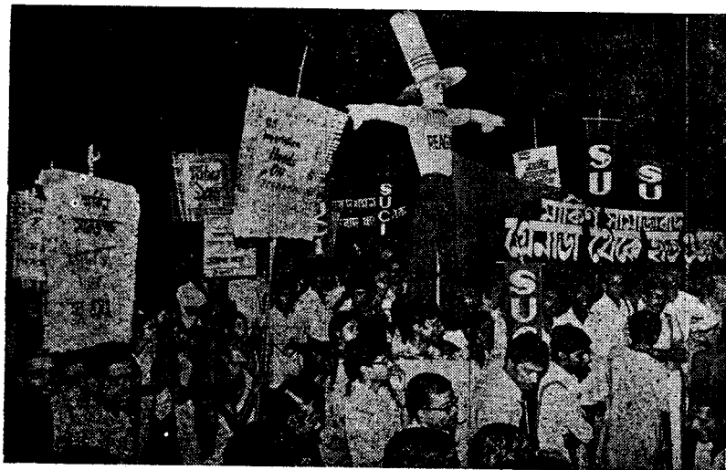
SUCI organised demonstration before U.S. Consulate in Calcutta against U.S. invasion on Grenada.

organised by the Information Bureau of West Bengal government at Tagore Hall near the Polytechnic bus stop.