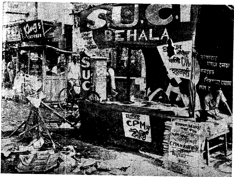
SUCI book-stall and photographic exhibition ransacked by CPI(M) stormtroopers at Behala, Calcutta.