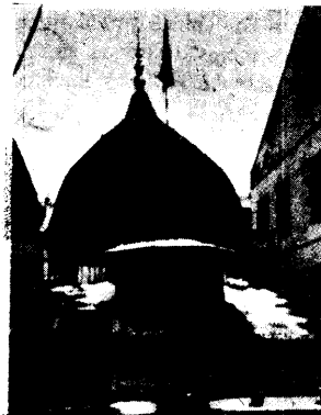
The Ganpatyar Temple remains unscathed

It is further reported about the Khir Bhawani temple which the BJP asserted as 'completely burnt': "Khir Bhawani for instance . . . continues even through troubled