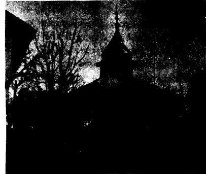
Rupa Bhawani Temple in Ganderbal : never burnt