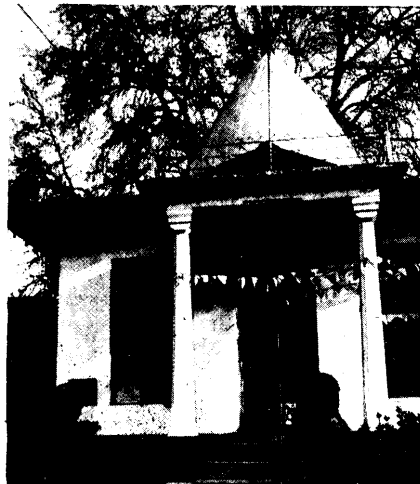
Dashnami Akhara : unaltered