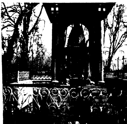
The famous Khir Bhawani Temple remains intact