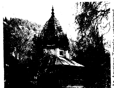
An Anantnag Temple : unimpaired

After the on-the-spot investigations of the 23 temples, the list of which was supplied by