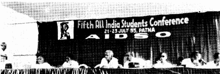
Dais of the Open Session of the Students' Conference at Patna

Korkonda—12-7-95 Four thousand tribal and oppressed peasants including 1500 women staged a massive demonstration before Korkonda Block Development Office in Koraput district in South-western Orissa under the auspices of our party SUCI. The people demonstrated against lack of minimum necessities of life and against the forgotten promises and assurances of the government. The rally demanded adequate supply of rice, prevention of hoarding and black marketeering in foodgrains, providing agricultural loans and free supply of seeds, fertilizer and pesticides to marginal farmers, at least one safe drinking water source for every 40 families, disbursement of old-age pensions, prevention of tree felling by unscrupulous forest contractors, large-scale afforestation in each village, motorable roads between each gram panchayat to the block headquarters and to check sky-rocketing of prices of essential commodities.