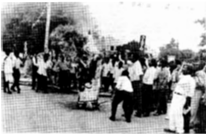
Bangalore DYO comrades burning the model of Atom Bomb on 6th August.

Trivandrum, 7th August : 6th August, the 50th anniversary of the inhuman atom bombing of Hiroshima by the US imperialist warmongers,