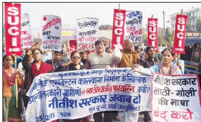
Protest in Patna against firing on struggling Chainpur-Bishunpur villagers