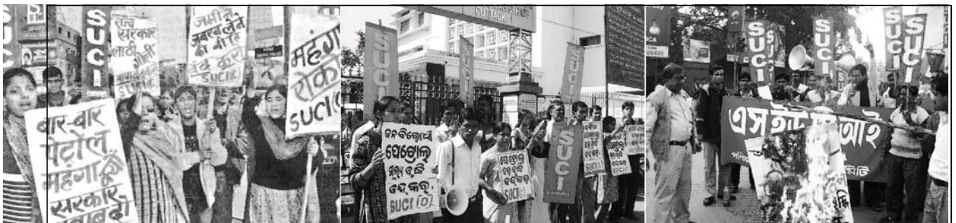
SUCI(C) protesting petroleum price hike on 16 January at Patna, Cuttack and Midnapur (from left)