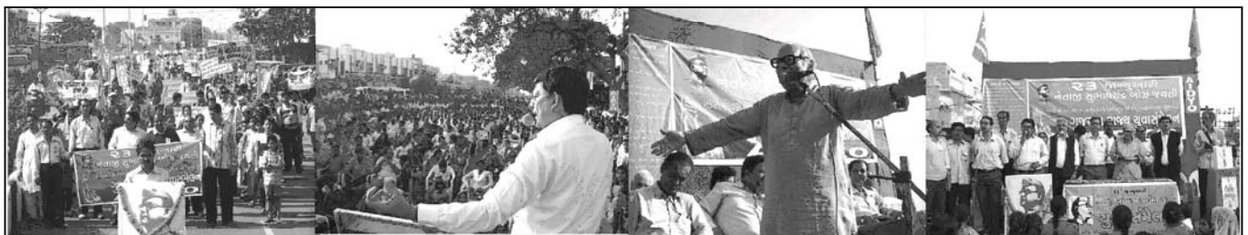
Massive gathering and eminent speakers at Gujarat State Youth Conference

The district rally was preceded by protest programmes at Hindupur, Dharmavaram, Kadiri, Syndicatenagar and C.K.Dinne and elsewhere and memorandum was submitted to the Tahasildars in each respective case.