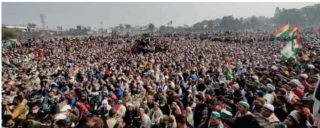
Mahapanchayat in Muzaffarnagar, UP, in support of the peasants' movement

But the peasants told them to their face that