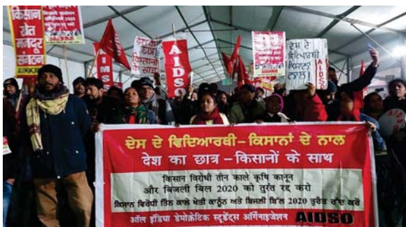
In Solidarity with the struggling peasants, AIDSO At Singhu Border 19 January

In support of the nationwide farmers movement, AIDSO, Karnataka, organised a bike rally on 21 January 2021, from Hussainiwala of Punjab, where the bodies of legendary freedom fighters Bhagat Singh, Rajguru and Sukhadev were burnt by the British rulers, to Singhu and Tikri borders of Delhi.