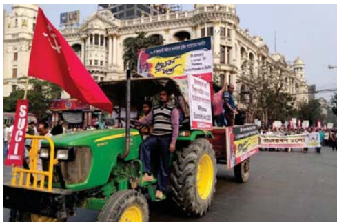
Solidarity rally in Kolkata on 26 January