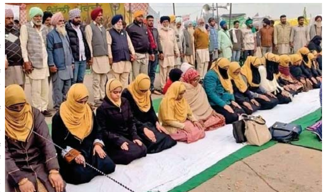
Sikh peasants guarding their Muslim sisters during Namaz at a movement spot in Delhi border

So, it is difficult to believe that the corporates would change colour overnight at the request of the Prime Minister or the government and do justice to the peasants. But the BJP Prime Minister continues to assure the peasants that the new laws would help doubling their income by 2022. We are only in 2021. Has the income of the peasants increased or has it been plummeting with every passing day. The government says widescale privatization is good for the peasants. Is it so? Ten years back, agricultural input sale (seed, fertilizer, pesticides etc.) was totally handed over to large MNCs by dismantling all government producers like the Fertilizer Corporation of India. What has been the outcome? Prices of those inputs have doubled, if not tripled making production cost extremely high. So, the peasants, most of whom have no access to bank or financial institutions borrow heavily at very high interest from private lenders. But they