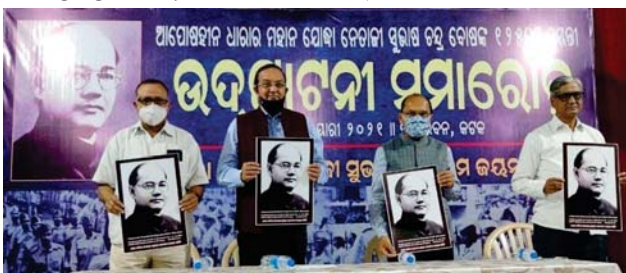
Cuttack, Odisha, where Netaji was born