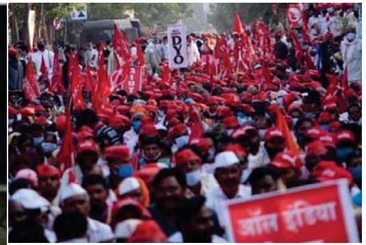
AIKKMS, AIUTUC and AIDYO activists at solidarity programme at Azad Hind maidan, Mumbai, on 26 January