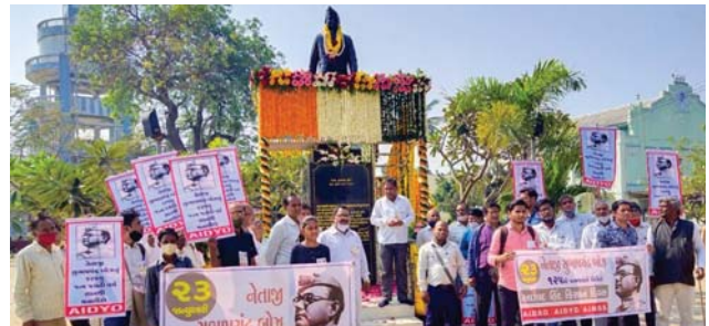
Haripura, Gujarat, where Netaji was elected President of the Congress

"You, the peasants, be united. Otherwise, your demands for rights would not find recognition. It is an irony that those who produce food for us, die because of dearth of food. In order to remedy the situation, the peasants need to develop a united front among themselves." (Speech at the meeting organized by Kisan Sabha in 1937)