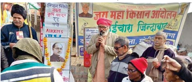
Singhu border, Delhi

Corrigendum : In Proletarian Era dated 15 January 2021, in the news item captioned "Is CPI (M) leader a corporate mouthpiece" on p7, please read 'Advani' as 'Adani' and 'no wander' as 'no wonder'. Error regretted.