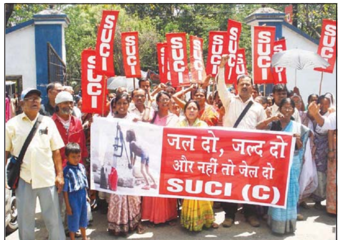
Demonstration by SUCI (C) at Jamshedpur, Jharkhand in demand of drinking water on 7 April last