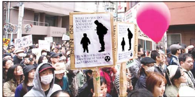
April 10 Anti-Nuclear power rally in Tokyo: Poster urges not to trust government

had earlier falsified safety data to hide the vulnerabilities of the nuclear plants operated by them. In 2002 TEPCO admitted to falsifying reports about cracks that had been detected in core shrouds at reactors number 1, 2, 3, 4 and 5 at the Fukushima Daiichi plant, as far back as 1993. The atomic power stations in India also have had their share of accidents. The safety violations in the Indian nuclear programme range from near