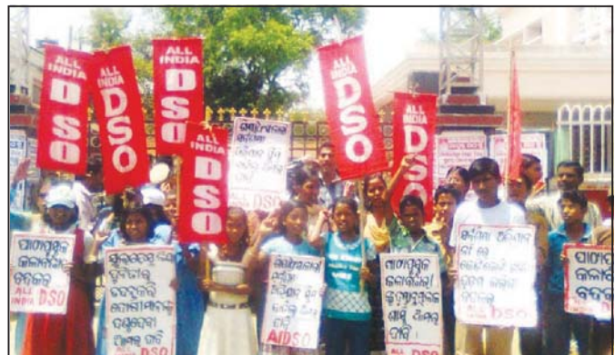
Demonstration by AIDSO in Cuttack, Orissa on 8 April against black-marketing of text books and other corrupt practices

Centre (AIUTUC) strongly protest against this anti-labour, pro-capital conspiratorial design of the government which strikes at the very root and concept of social security and hence call upon all sections of working people in general and government employees in particular to stand united against this design and build up united movement on the demand of withdrawal of this BLACK BILL.