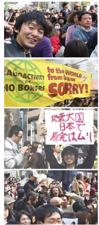
Massive anti-nuclear power rally in Tokyo, throwing caution (in Japanese) 'no nuclear power in land of earthquakes and tsunamis'

solar power, wind power, mini hydro power, clean coal technology, etc.