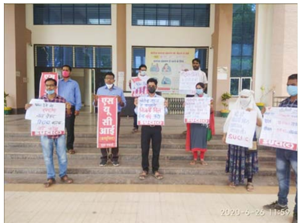
Guna, Madhya Pradesh