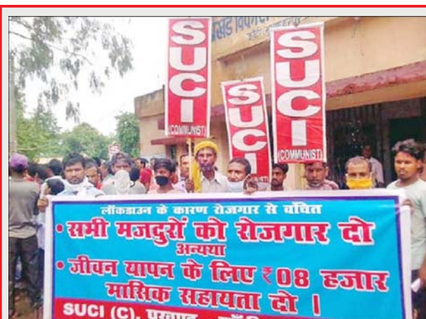
Demonstration in Kanti, Bihar demanding job for all migrant workers

market for the domestic and foreign monopoly houses. It proposes further division of earlier categories by way of introducing distribution of sub-licenses and franchise system. Obviously, this would reduce the charges to the monopoly houses who have made decisive forays into the power sector and they would impose more burden on the common consumers by way of increased tariffs. As of now, states like Tamil Nadu, Punjab and Haryana are getting free power for irrigation. Especially in Tamil Nadu, for domestic users, power consumption