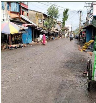
Total bandh in Kultali on 6 July

armed criminals who once were in the fold of the CPI (M) but switched to Trinamool Congress(TMC) once the power switched from the former to the latter. Comrade Jana was strangled to death and then hanged from the ceiling. From 3 July, armed TMC gangsters riding on motor-bikes and four wheelers pounced upon our Party leaders, workers, supporters, sympathisers and panchayat members, hurled bombs at them and set their houses and shops ablaze. As a result, 200 houses and 80 shops were burnt into ashes, many including women sustained grievous injuries. Forty people were so brutally battered that they needed hospitalization. The whole area is surcharged with tension and the beastly savagery of the ruling party goons has been condemned and resented by one to all except the bootlickers of the ruling dispensation and the corrupt nexus embezzling relief money and material flexing muscle.