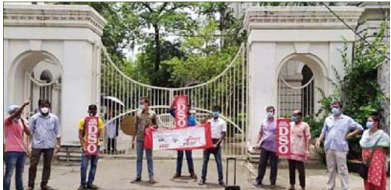
AIDSO protests on-line education in front of Presidency University , Kolkata

girls and 1 boy so far, from all over the country (e.g., Kerala, Punjab, West Bengal, Gujarat and Assam) where the hapless student could not avail of online classes for want of proper smartphones or other requisites due to the pecuniary difficulties in their families. As mentioned, even a parent committed suicide for having failed in providing his daughter of Class X, with the all-important smartphone. The series is likely to extend if and when online becomes the so-called new normal. And this is what even the high-ups in official levels also apprehend. A distinguished fellow at the Research and Information System (RIS), a foreign ministry think tank, thus held that the online mode makes education unequal, given the inequalities in households' access to electronic gadgets. Even the agencies like UNESCO or UNICEF, which are basically appendages of the imperialist