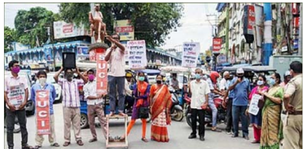
Krishnanagar, West Bengal