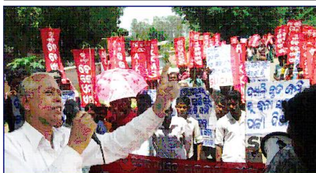
A massive demonstration held before Harichandanpur Tahashil, Keonjhar, Odisha organized by SUCI (C) and AIKKMS on 15 th July, 2013, demanding allotment of patta to the peasants.