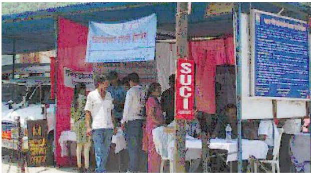
Rudraprayag Base Camp

Our Party, SUCI(C) extended all necessary help and assistance towards organization of these medical camps.