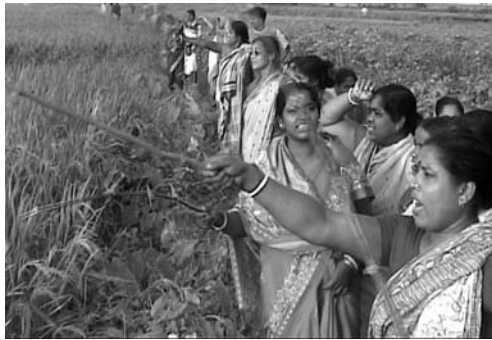
Village women offering resistance to police intervention in grabbing their agricultural land in Singur, West Bengal

move or adopt brazen anti-working class policy, does it make obligatory on the part of a Marxist party to follow the suit? Then where is the difference? Marxism teaches the workers to valiantly fight against the ongoing oppression and suppression of the bourgeoisie, thwart all its sinister moves and designs by intensifying class and mass struggles, defend and realize their legitimate rights through struggle. Instead, if in the name of preserving working class interest, the counseling is to slacken this struggle alluding to some situational compulsion, will not that be tantamount to kill the fighting spirit of the workers, disarm them from within, lead them to a supine surrender before the aggressive posture of the owners and ultimately strengthen the bourgeoisie in its tyrannical pursuit? Can that by any stretch of imagination be called Marxism or it is vulgarization of Marxism much to the glee of the imperialists-capitalists designing SEZs to suck out the last drop of blood from the workers?